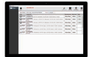
CLOUD-BASED VEHICLE HISTORY

eTechnician™ 2.0 gives you the data and the support required to stay competitive in today's trucking industry. Heavy-duty diagnostics on your PC was never this good—until now. We've combined extensive coverage for everything from commercial vehicles right down to light and medium-duty trucks. That gives you diagnostic capability for engines, transmission, brakes, body and chassis, and more. And we've added cloud-based, fleet-wide vehicle history to give you access to data for every diagnostic session for every vehicle in your fleet, regardless of location.